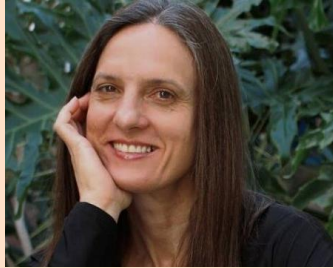
Gynaecologist Prof of Sexual & Reproductive Health