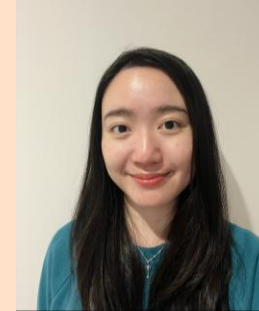
3 rd year medical student MD project