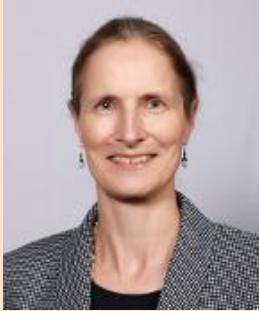
Endocrinologist, Nepean Hospital